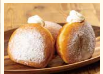
WHIPPED CREAM ¥350 (+tax) 【Available from】10a.m.~