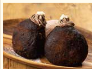
CHOCOLATE ¥390 (+tax) 【Available from】10a.m.~