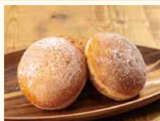
PLAIN ¥200 (+tax) 【Available from】8a.m.~

※Photos are for presentation purposes only. Prices are per piece. ※Customers dining in are kindly requested to order a drink.