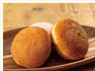
CINNAMON ¥200 (+tax) 【Available from】8a.m.~