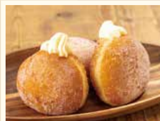
CUSTARD ¥390 (+tax) 【Available from】10a.m.~