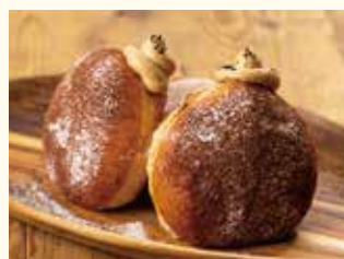
TIRAMISU ¥350 (+tax) 【Available from】10a.m.~