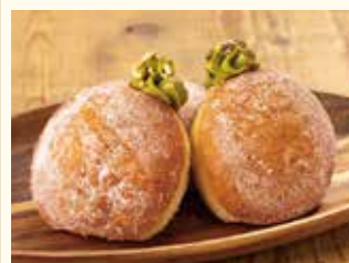
PISTACHIO ¥450 (+tax) 【Available from】10a.m.~